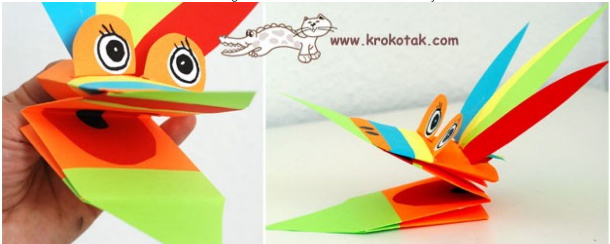
Parrot - with extra added eyes, beak and feathers extended