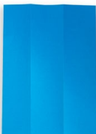
прегънете го на три по дължина