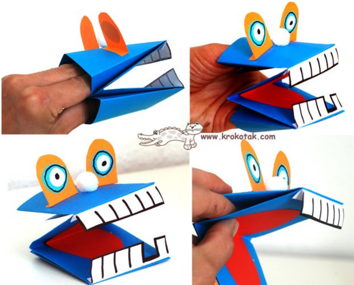
Monster - stuck with extra eyes and teeth inside the mouth Glove compartment - with extra eyes and mouth glued inside