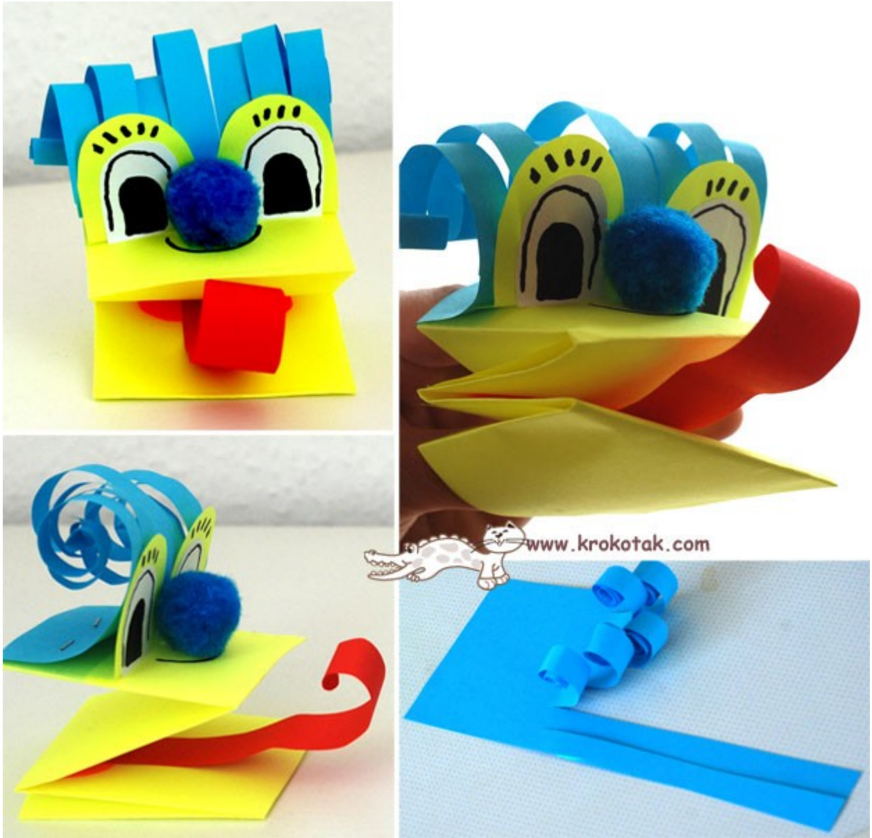
Clown - a curled paper hair attached behind ball nose and eyes and added dopanlitelno language