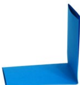
сгънете го по средата