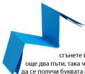
сгънете го още два пъти, така че, да се получи буквата М