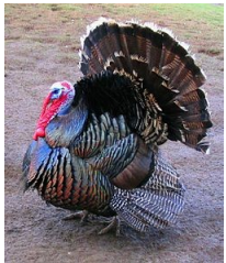
NEA PIG TURKEY